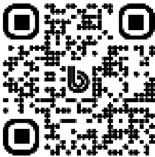
Band App For Students & Parents